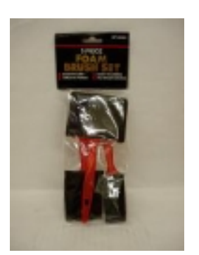
Package of 3 Foam Brushes Small, Med, Large 609-198