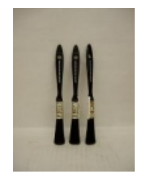
1/2" 100% Polyester Paint Brush -388710