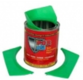
POR 15 PAINT SPOUT-PS50