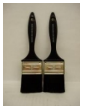
2" 100% Polyester Paint Brush 388-694