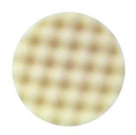
3M™ Foam Compounding Pad

White pads are made for polishing. They are great for appling the final compound. Blue pads are 3M's Aquafina pad. It is used in place of the white pad with 3M's Aquafina compound on dark colors especially black. Which shows all scratches and swirls.