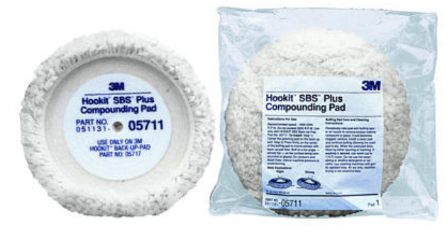
3M™ Wool Compounding Pad

absorbing too many compounds and having too much build up. Keep you pads in seperate bags to keep them from getting dust, dirt and contaminants in them to scratch the surface of the paint. When you get too much compound build-up, use a tool or screwdriver to help remove the excess.