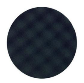
3M<sup>™</sup> Perfect-It<sup>™</sup> Foam Polishing Pad